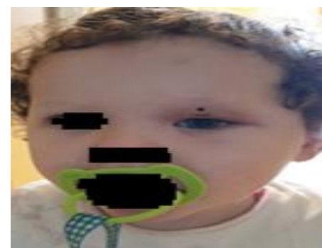
Figure 3: improvement in left eyelid swelling (the eye can easily be opened) 48hours after intravenous treatment, notice the wound scar (*) on the upper eyelid

The clinical response was rapidly favorable after 48 hours with a marked reduction of the edema and opening of the eye (fig.3). A total recovery was obtained by the 10 th day (fig.4).