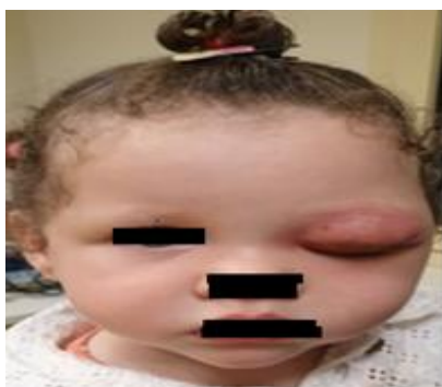
Figure 1: Clinical photography showing severe and total left eyelid ptosis (the opening of the left eye was impossible), proptosis and swelling

Two days after the onset of complaints (Swelling, redness and fever), the parents consulted a general practitioner who prescribed topical eye drops (local antibiotics) and oral nonsteroidal anti-inflammatory (NSAI) drugs. Apparently, there was no relief. In fact, the case having got worse, the child was urgently referred to us for appropriate care. Examination revealed diffuse erythematous swelling of the left upper eyelid. The opening of the eye was impossible. Congestion along with purulent discharge was present in this eye (fig.1). Clinical examination of ocular movements, pupil reactions and Fundus was therefore limited. The examination of the right eye was normal.