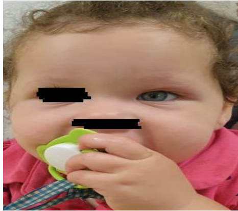
Figure 4: clinical photography on the 10th day of treatment : fully healed