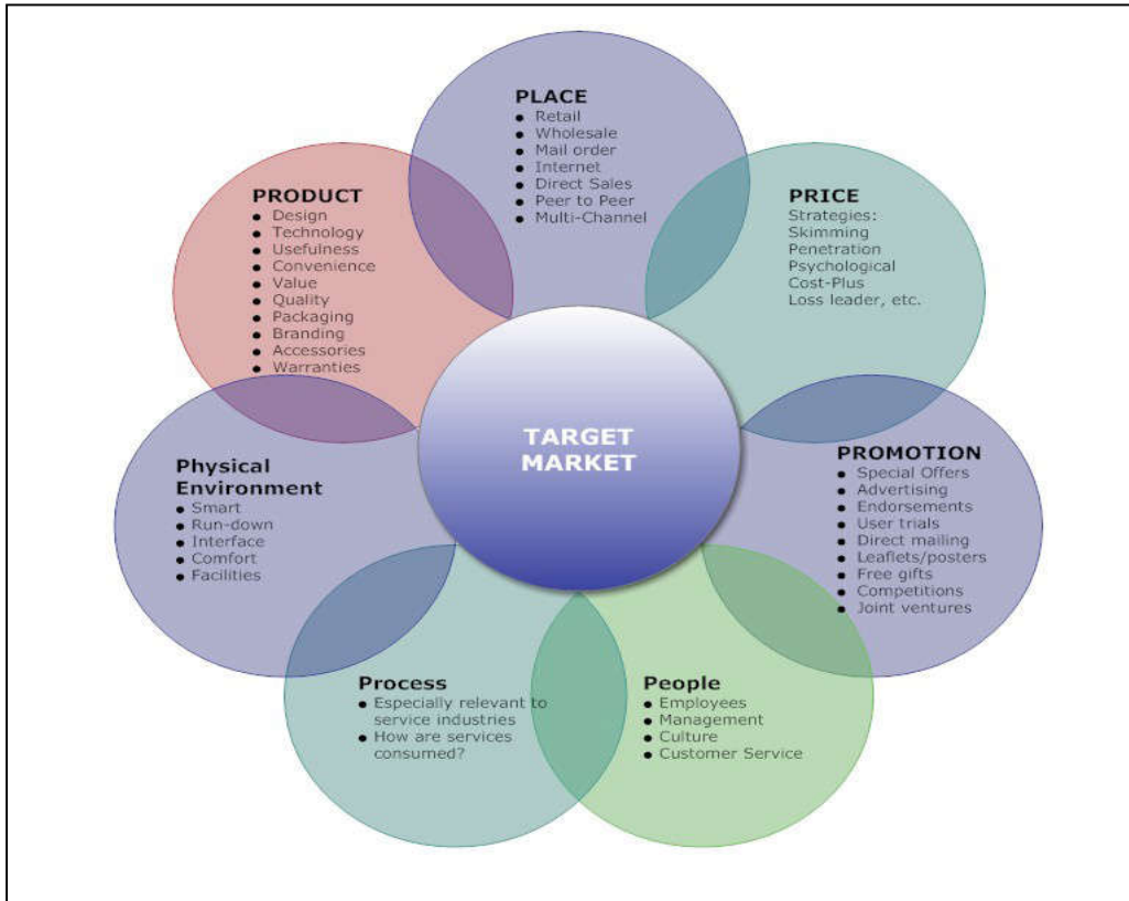
Fig.3: Target Market