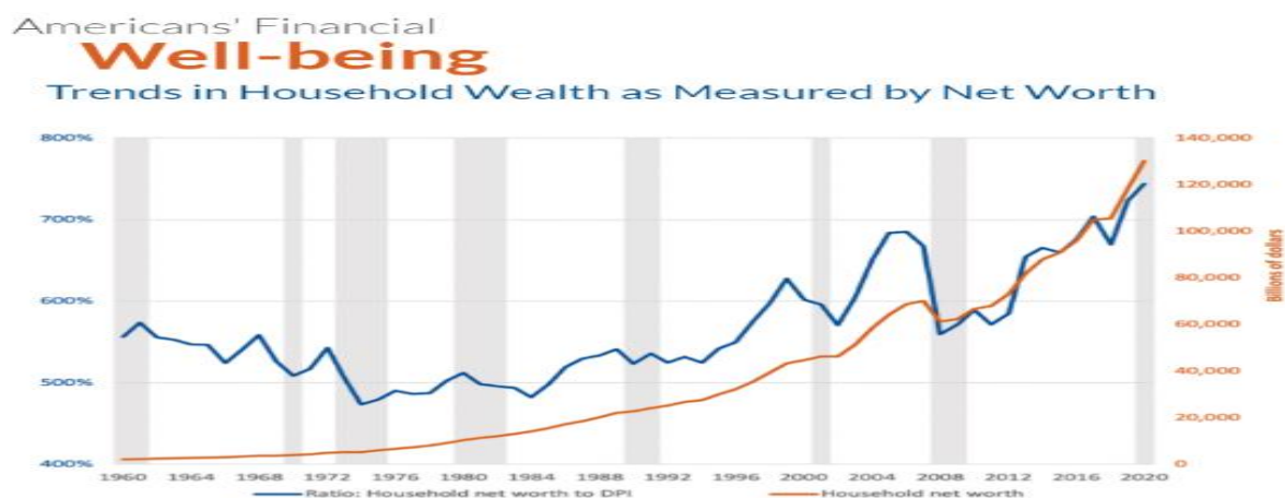
Figure03: Americans' financial well-being