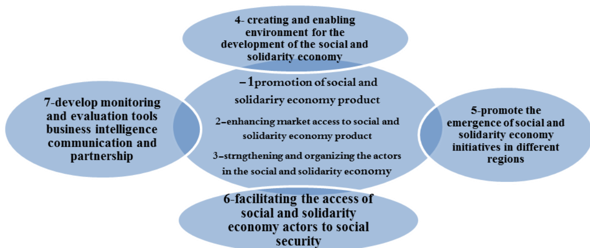
Figure 2: Illustrating the strategic axes for strengthening the SSE initiative in Morocco

In fact, the government has given a privileged position to the development of the social and solidarity economy, and intends to make it one of the pillars of the local economy and a locomotive for the development of income-generating activities throughout Morocco. To achieve these goals, the strategy is formulated around 7 main axes: