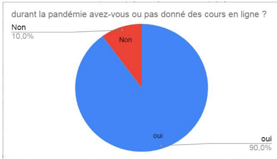
Figure n° 01: The use of online learning during the pandemic

The results of the first question in the chart below show that the great majority (90%) of the respondents have indeed switched to online learning against 10% only who said had not delivered any course online.