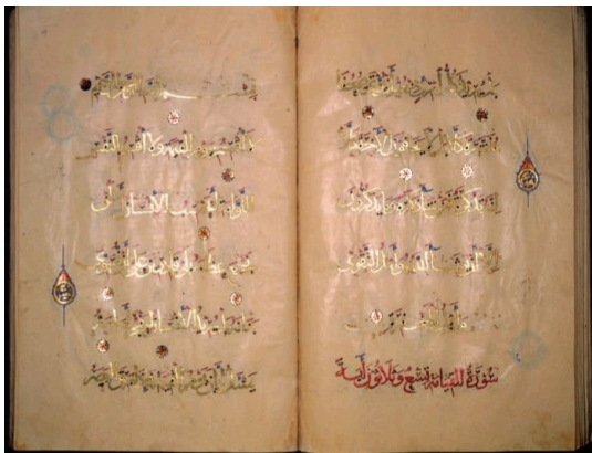
Figure N° 7: Baybars Quran

Sultan baybars' Qur'an ,British Library ,p02.