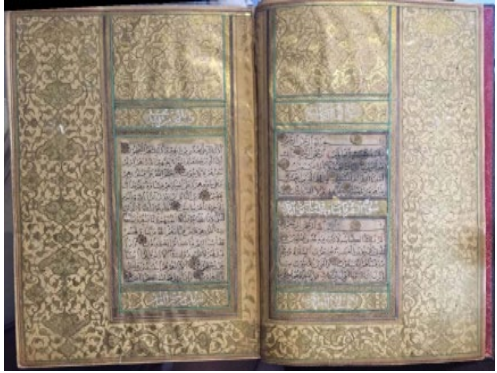
Figure N° 6: The Holy Quran of Al-Mustasami

نصار محمد منصور ،الخطاط ياقوت المستعصي دراسة تحليلية للخصائص الفنية لأسلوبه في الخط الريحاني ،المجلة الأردنية للتاريخ والآثار ، المجلد 12، العدد 19، 2018، 57-2، ص 37.