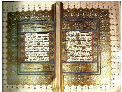
Figure N° 8 : The Holy Quran of Sheikh Hamad Allah Al-Amasi

عبد العزيز حميد . (1971). تاريخ الخط العربي عبر العصور القديمة . لبنان: دار الكتب العلمية ص 244