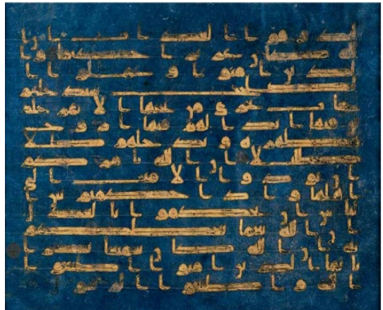
Byzantium and Islam: Age of Transition, 7th-9th Century, Metropolitan Museum of Art (New York, N.Y.) P 276