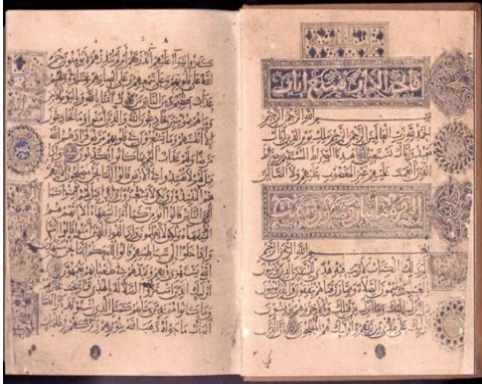
Figure N° 5: Ibn Al-Bawab'sMushaf

خط المصحف الشريف و تطوره في العالم الإسلامي، عبد العزيز حميد صالح، دار الكتب العلمية ،بيروت لبنان ، ص 220