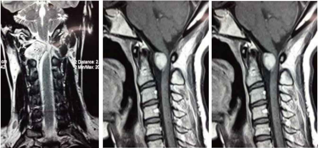
fig 1. cervical preoperative MRI : heterogeneous lesion opposite c1-c2 compressing the cord (T1 and T2 gado)