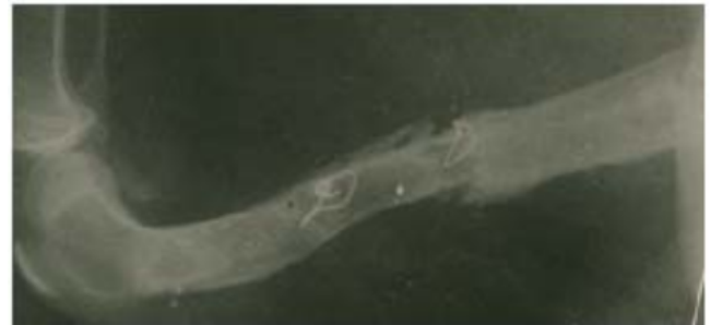
Case N° 10: (After 15 weeks) Complete bone union occurred in each interface after pin remove.

The use of fenestrated allograft has showed rapid callus bridging and high stability this is due to the penetration of the callus in the holes, and the contact of the internal and external callus. The fenestration didn't affect the graft resistance; this can be proved by the fact that the heaviest dog had the fenestrated graft (case n° 9 and 10). The fenestration disappears rapidly after pin remove (case n° 10).