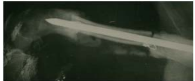
Case N° 6: (After 3 weeks) Partial callus formation with graft resorption.