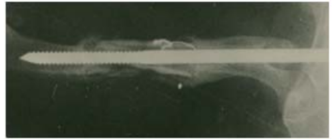
Case N° 5: (After 20 weeks) The fracture of the graft in his distal part.

or high resorption of autoclaved graft was also the first problem cases n°5, 6, 7.