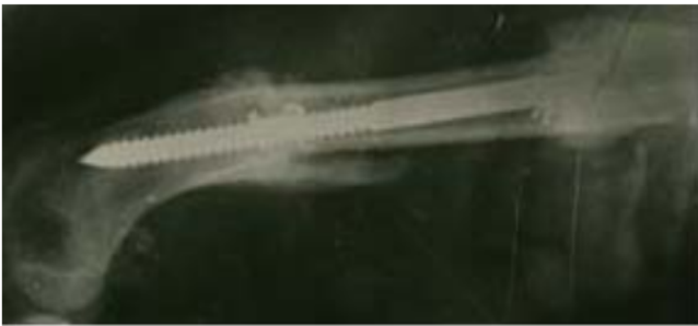
Case N° 3: (After 3 weeks) Disappearance of fracture line.

Bony substitution using segmental freeze dried and fresh cortical allograft has been performed with limited length for at least 5 cm [4, 12, and 13]. In retrospective analysis of failure in the repairing of severely comminuted long bone fractures using large diaphysal allograft the successful canine allograft was 6 cm [14]. Other studies of bony substitution with microvascular anastomosis mentioned the maximal length of 38% of the total femur length [15].