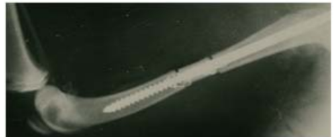
Case N° 11: (Postoperatively)