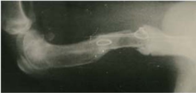
Case N° 8: (After 20 weeks) Three weeks after pin removing, we can observe the complete disappearance of fracture line.

Cortical union usually occurred shortly after complete periosteal bridging. The approximate time of cortical union at the proximal interface for the fresh cortical autograft was 12 weeks and 15 weeks in both the freeze-dried and fresh cortical allograft. At the distal interface, these values were 11 weeks in fresh cortical autograft and 18 weeks in the freeze-dried and fresh cortical allograft [12]. In our study delayed union at the proximal interface has been observed in the cases n° 4 and 11 and at the distal interface in cases n° 8, 9 and 10.