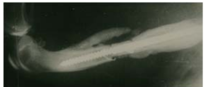
Case N° 11: (After 5 weeks) We can observe in this radiography the successful callus bridging in each interface.