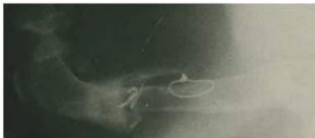
Case N° 4: (After 46 weeks) A complete graft healing in the proximal interface after pin remove can be observed.

In our study, the maximal successful length of autoclaved allograft was 6 cm which represented 33% of the total femur length case n°4.