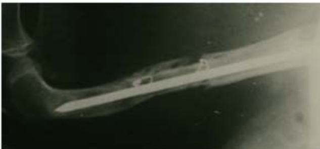
Case N° 10: (After 12 weeks) Complete union is observed in the distal interface.

The cortical union at the proximal interface occurred after 8 weeks in the case n° 11 and after 12 weeks at the distal interface in the cases n° 8 and 9. In the case n° 10 the cortical union at distal interface occurred after 13 weeks and after 18 weeks at the proximal interface in the case n° 4. The complete callus bridging with disappearance of fracture line was observed after 3 weeks in the case n° 3.