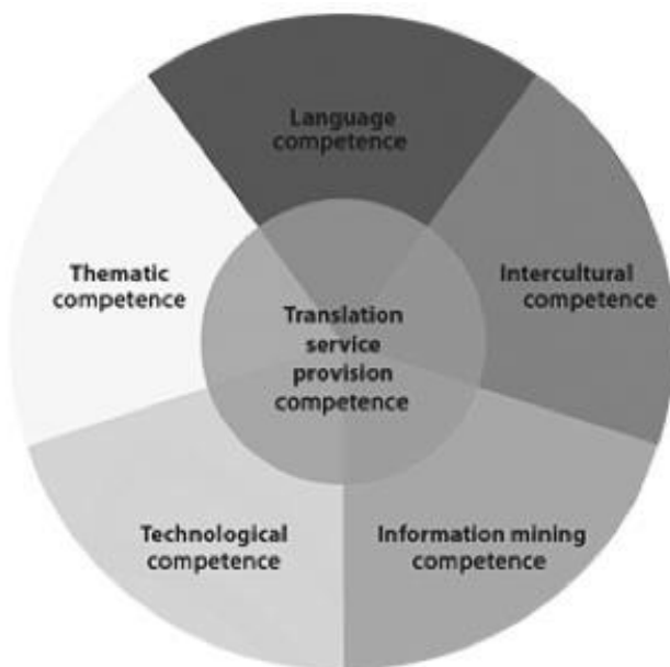
Figure 2: Competences for professional translators, experts in multilingual and multimedia communication by EMT Expert Group (2009)

approaches to clients, negotiating with the client to define deadlines, tariffs/invoicing, working conditions, access to information, contract, rights, responsibilities, translation specifications, tender specifications, knowing how to plan one's time, stress, work, budget and ongoing training, etc. (EMT Expert Group, Brussels, 2009).