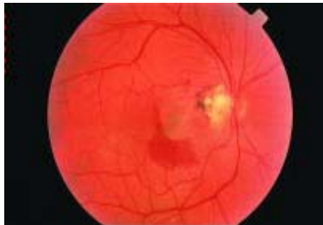
Figure 3: A choroidal neovascular membrane with subretinal hemorrhage and lipid exudates.

In the wet form, also called exudative or neovascular AMD, vision loss can occur suddenly when a choroidal neovascular membrane (Fig3) develops in the sub-RPE, between the RPE and Bruch’s membrane, and it subretinal space, between the neurosensory retina and RPE, and it leaks fluid or blood. 5