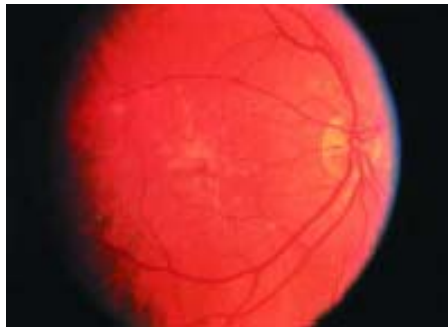
Figure 2 Numerous soft drusen are noted to coalesce beneath the retina in the macula.

Age-related macular degeneration is typically classified into two clinical forms, non-exudative or “dry” and exudative or “wet”, both of which can lead to visual loss. In the dry or non-exudative form, visual loss is usually gradual. The hallmark changes that are seen in the macula are yellow subretinal deposits called drusen, or retinal pigment epithelium (RPE) hyperpigmentary or hypopigmentary irregularities (Fig2). Drusen may enlarge and become confluent, and even evolve into drusenoid RPE detachments, where the RPE becomes separated from its underlying Bruch’s membrane. These drusenoid detachments often progress to geographic atrophy, where the RPE dies from apoptosis or into wet AMD.