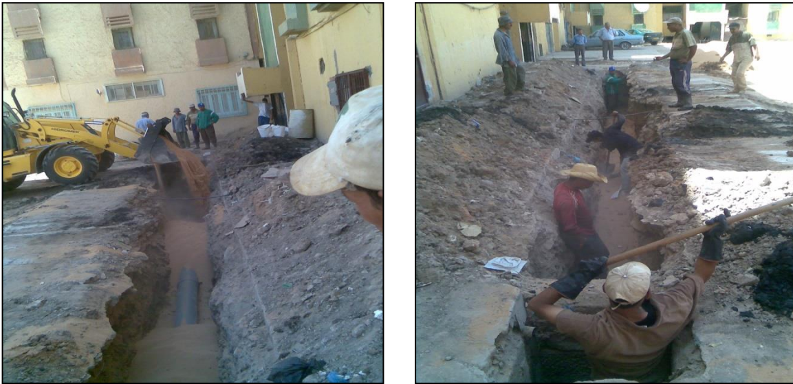
Fig 6. Main manhole sewers were moved completely outside the building.