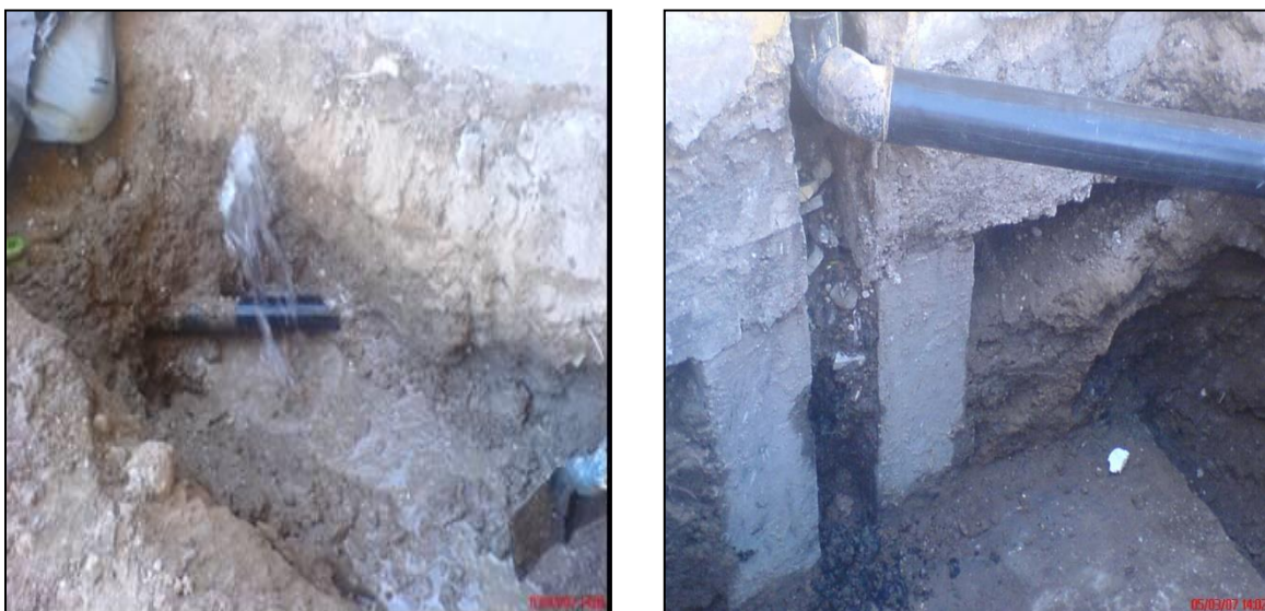
Fig 5. Infiltration of wastewater through cracked pipes.