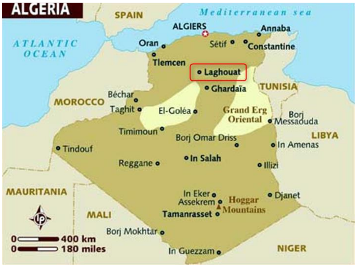
Fig 1. . Map of Algeria, situation of Laghouat.