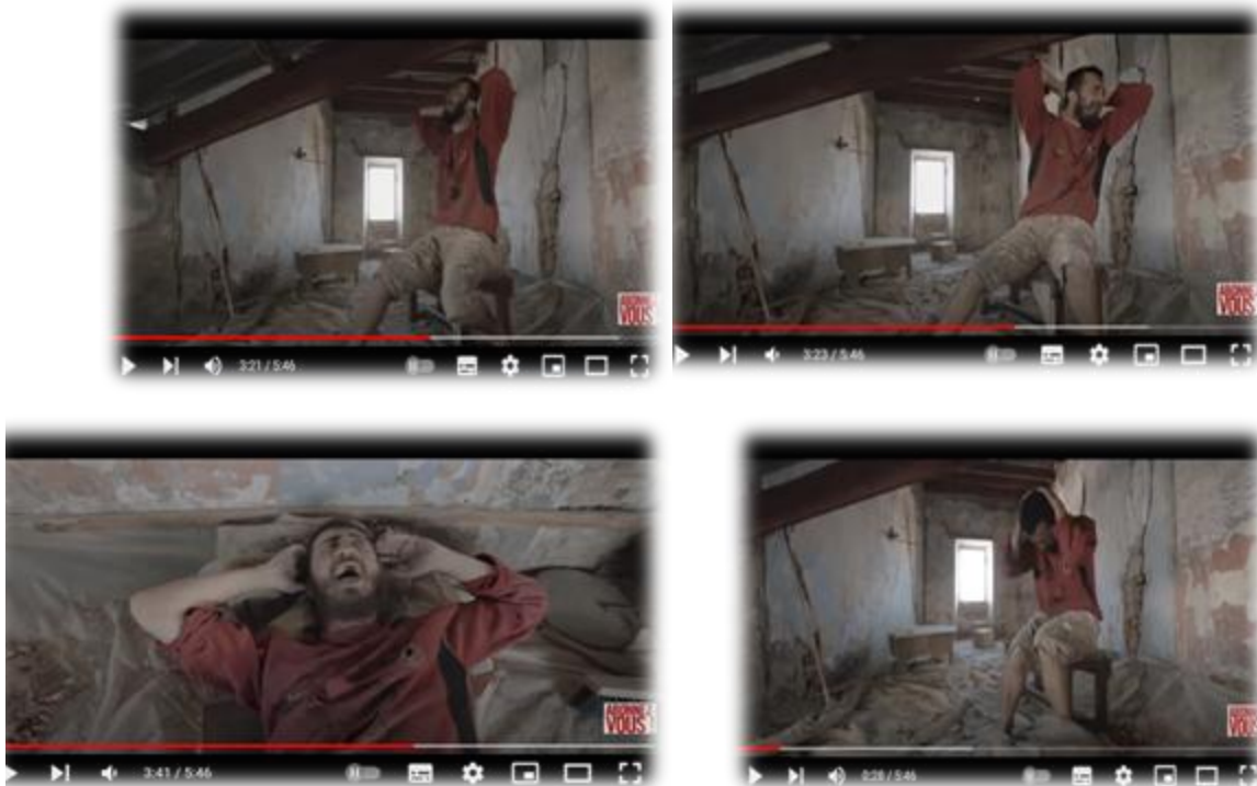
Figures (5): Putting hand on head

Putting the hand on the head and rubbing it or shaking it slightly can metaphorically convey a sense of Expressing frustration, disappointment or confusion, it can also defined as a sense of exasperation or bewilderment, as if saying "I can't believe this is happening" or "I don't understand what's going on".