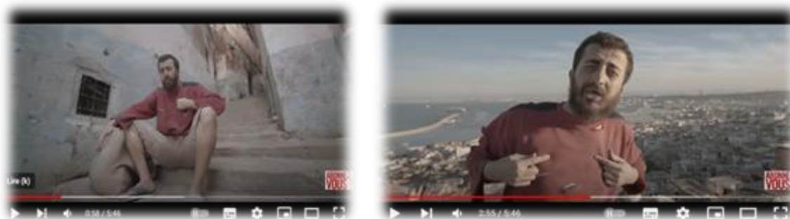
Figure (1): pointing gesture /Open palm towards oneself

The data set ‘s hand gestures were categorised into four main categories. This type of categorisations and analysis follows the ones presented in McNeill (1992, Harrison 1998). Many hand gestures were defined in this video to represents the population's dissatisfaction with the political situation in Algeria, as well as a moral lesson and message for the audience. The sections that follow will provide illustrated examples and explanations for each category: