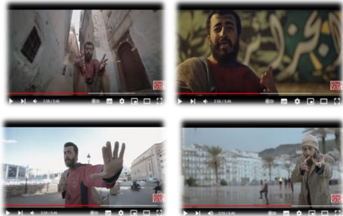
Figure (3): Open palm towards camera/metaphoric gesture

Palm up metaphorically mean pushing something away, stopping it, or just plainly saying “no”. In some two handed cases it can symbolise a metaphorical “hands off ” approach, depending on the positioning of the arms. In cases signaling “stop” or similar, the hands will be placed in front of the body, as illustrated by the first image. In the “hands off ” case the arms