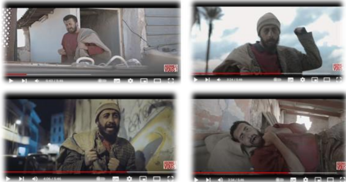
Figure (6): clenched hand/ defensive gesture

In this gesture, hand is tightly closed into a fist, with the fingers and thumb wrapped around each other. The clenched hand gesture is associated metaphorically with vlogger anger, aggression, or defiance, and it may be used as a signal of protest or resistance.