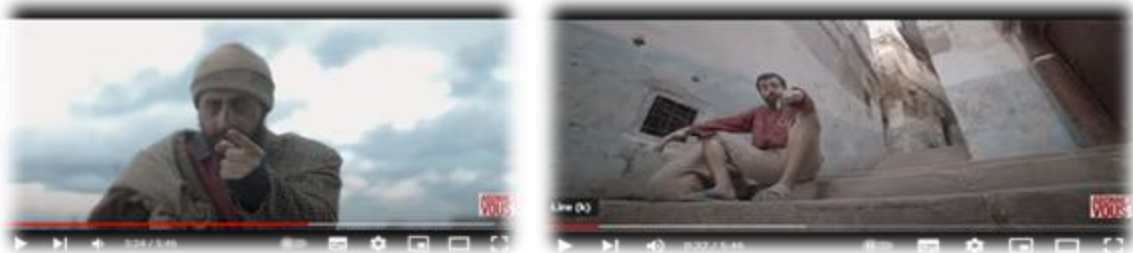
Figure (2): iconic gesture pointing gesture

In this gesture, vlogger used an open hand or palm with the index finger is typically extended and directed towards someone’s else’s space or personal area, he ties them to your word to make them feel included. A pointing gesture is commonly used consciously as a marker for direction, in ambivalent cases a clarification of which entity is being referred to, or for nominating the next speaker in a conversation.