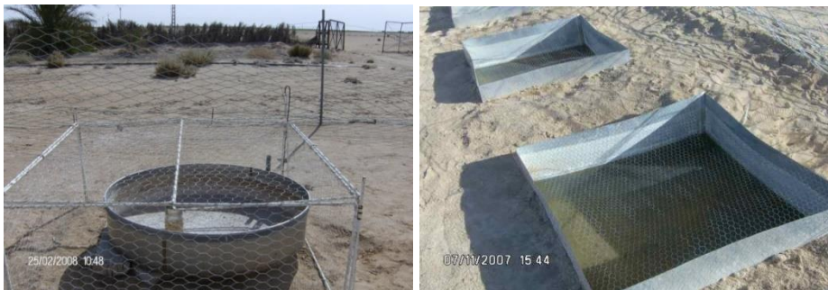
Figure 3: Class A and Colorado evaporation pan

The evaporation process of the tanks (figure 3) is also based on the law of the water balance, with the total absence of underground flows and losses by infiltration, parameters very difficult to estimate (Vuglinsky, 1991).