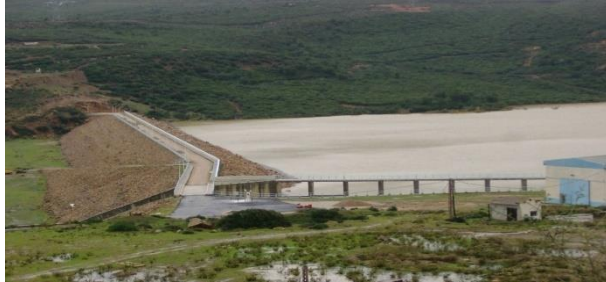
Figure 2: Reservoir dam.

The evaporation of water (by volume) from a reservoir dam is determined by the following relationship: