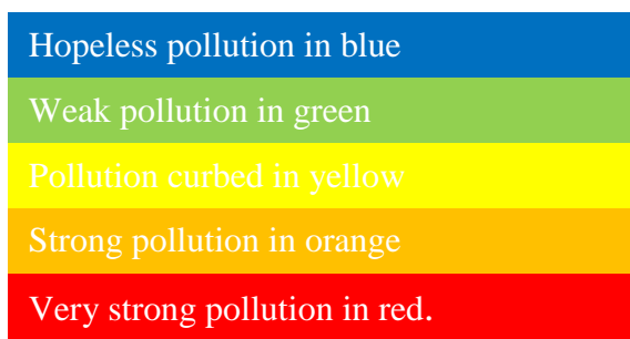
Figure 2: Color according to the classes of quality.

Following the different points of withdrawal permitted to calculate the natural indications of organic pollution of waters of the township of Abomey-Calavi.